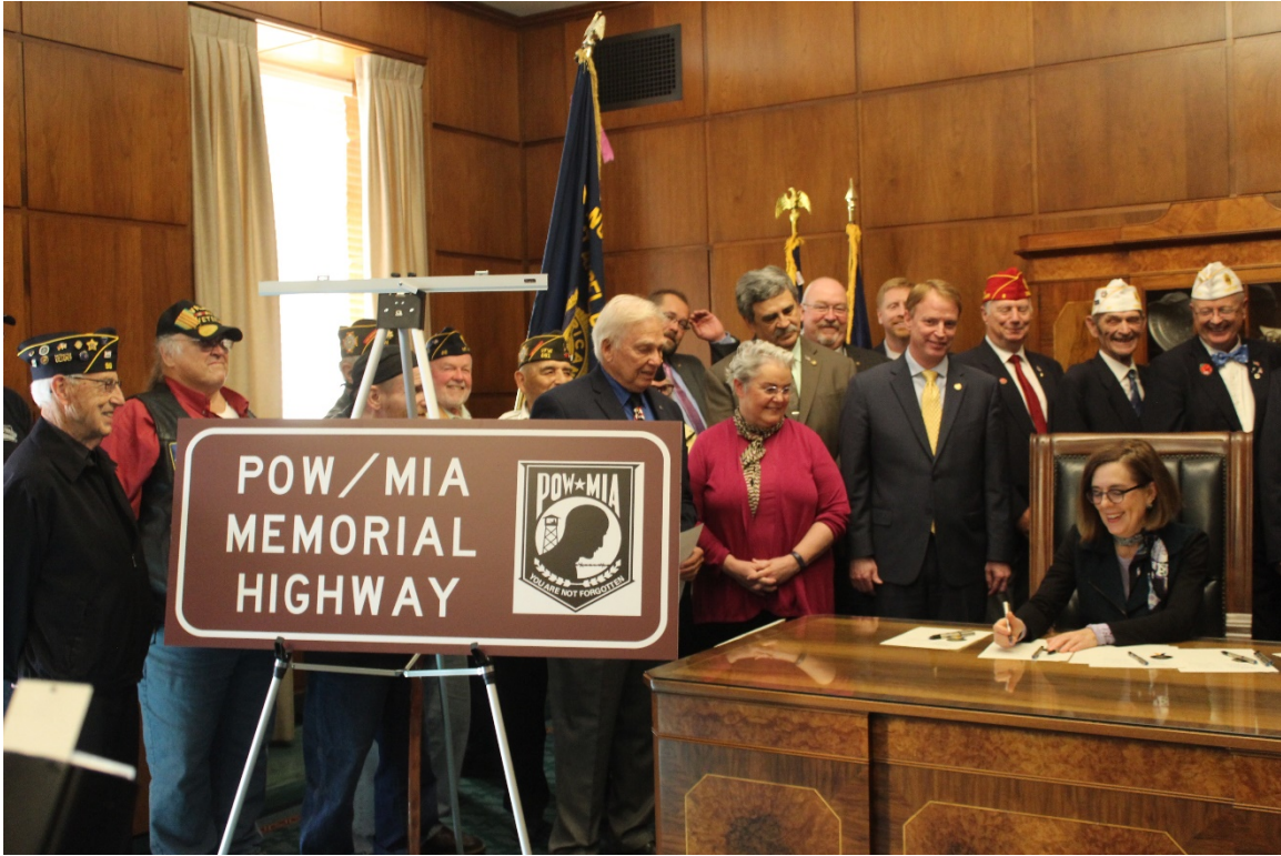
HALF SCALE POW/MIA MEMORIAL HIGHWAY SIGN, WITH GOV. BROWN SIGNING HB 3452 SEPT.