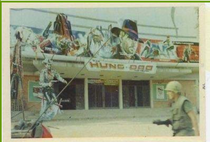
Hue - North Side of River Rau Quist Heading West

20 Feb Mon – (Day Ten) Today we tour “Leatherneck Square” in Quang Tri Province and visit these important sites - Con Thien, Cam Lo, the “Washout”, Gio Linh, The Peace Bridge at the Ben Hai River and the Dong Ha Bridge. After lunch in Quang Tri, we head for Hue. Hotel: Imperial (B/L in Quang Tri/D on your own)