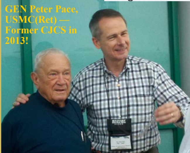
GEN Peter Pace, USMC(Ret) — Former CJCS in 2013!