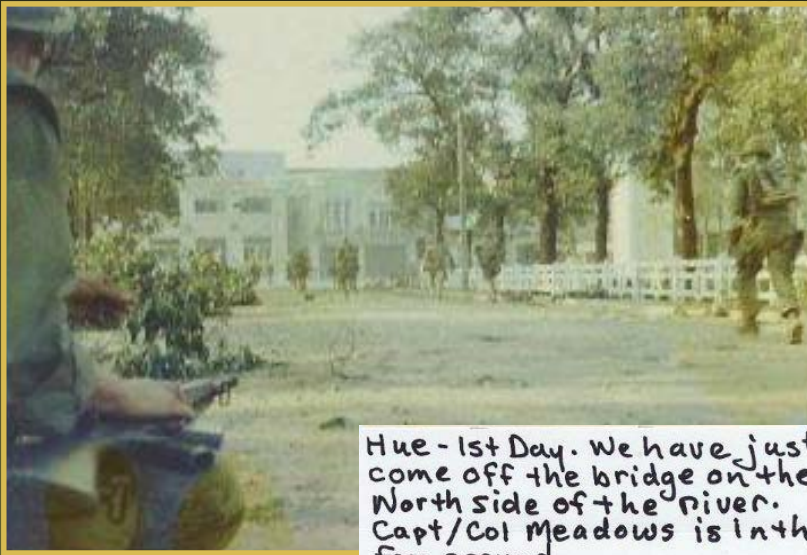
Hue - 1st Day. We have just come off the bridge on the North side of the river. Capt/Col Meadows is in the foreground.

Tour Host: Col "Chuck" Meadows, USMC (G/2/5 - Hue City) Tour Leader: Col Dave Wall USMCR(Ret)