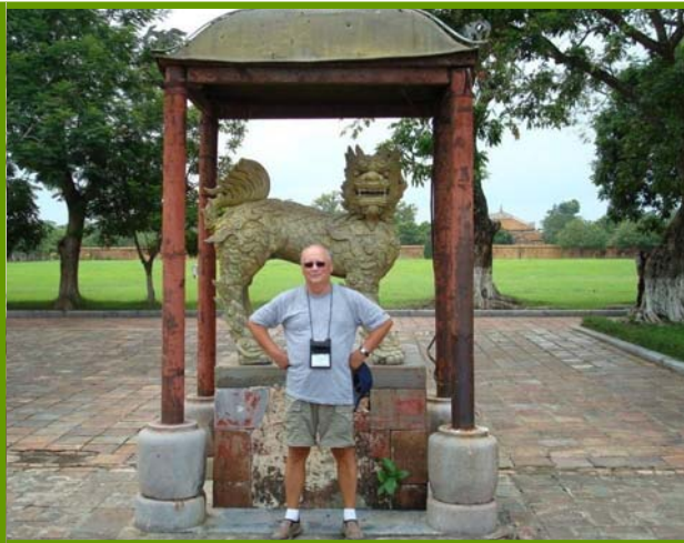
Above: Citadel Then & Now - 45 years later...less a weapon and some hair!

visit to Hanoi with a walking tour of the Ho Chi Minh Mausoleum and Presidential Palace plus a trip to the Hoa Lo Prison (“The Hanoi Hilton”). Remainder of the day for some last minute shopping and preparations for our evening flight home. Hotel: Silk Path (B/L)