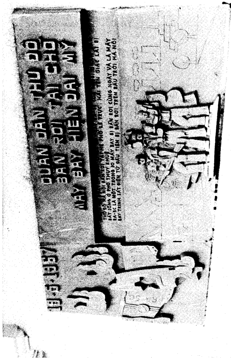
This bas-relief on a factory wall in Hanoi reports the shootdown of an American aircraft. JCRC and DIA analysts evaluated clues such as this in their efforts to determine the fate of missing Americans.