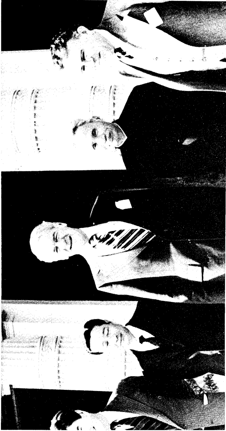
Members of the House Select Committee on Missing Persons met with Vietnamese officials in Hanoi in late 1975. Left to right: Congressman McCloskey (partially visible), Vice Foreign Minister Phan Hien, Congressman Montgomery (Committee chairman), Prime Minister Pham Van Dong, Congressman Gilman. Congressman Ottinger, not shown, was also a member of the party.