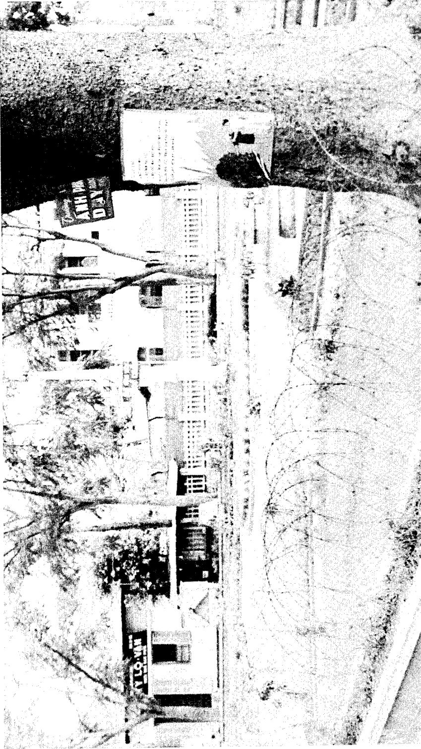
A poster on a tree in Can Tho City solicits casualty resolution information from the local populace.