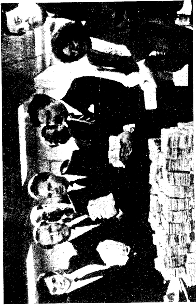
A display of one million dollars in cash, representing a reward offered for the safe return of an American prisoner-of-war from Southeast Asia. Published by the The Nation , with credit to the Associated Press.