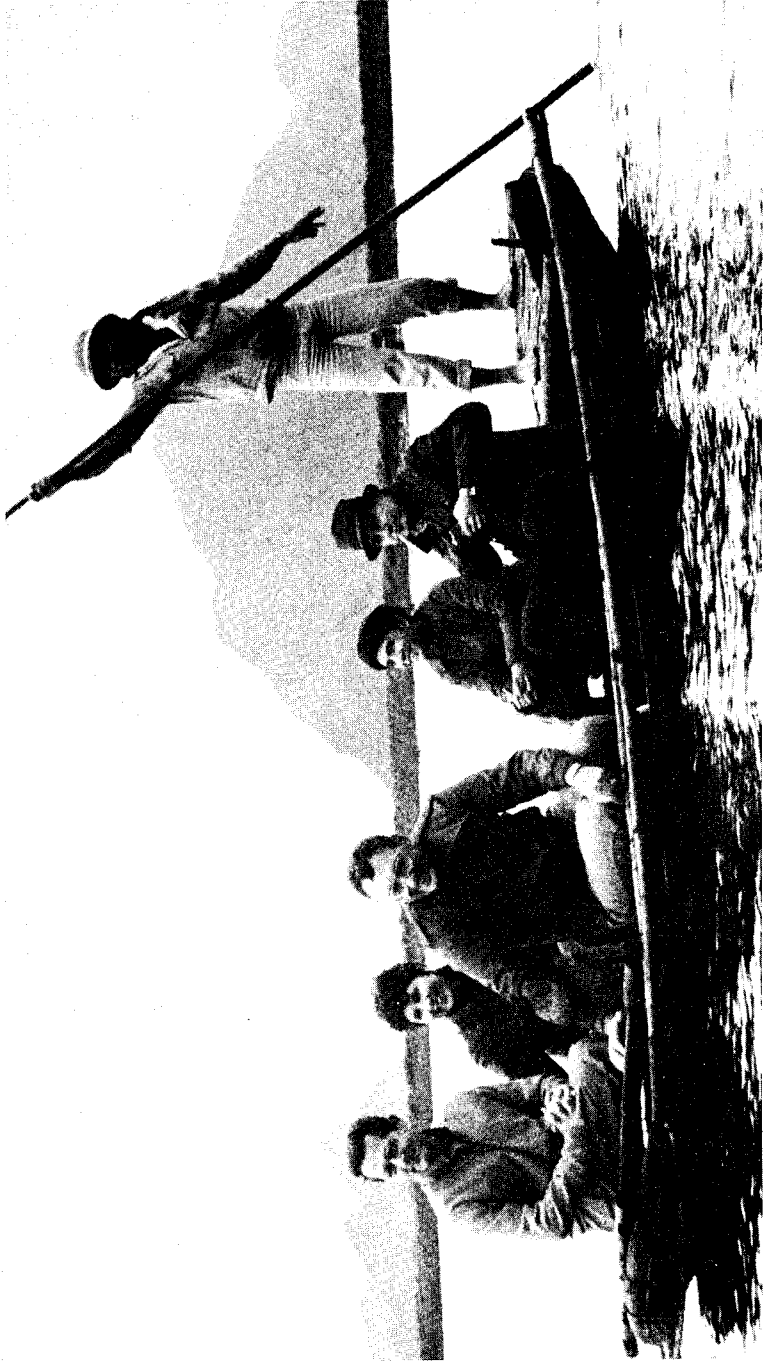
A joint American-Vietnamese team is poled across a reservoir near Thanh Hoa en route to view the site of the crash of an American aircraft.