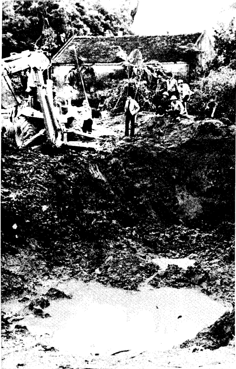
American and Vietnamese workers excavate the site of a 1972 B-52 bomber crash near Hanoi in an effort to recover any identifiable remains of the crewmen.