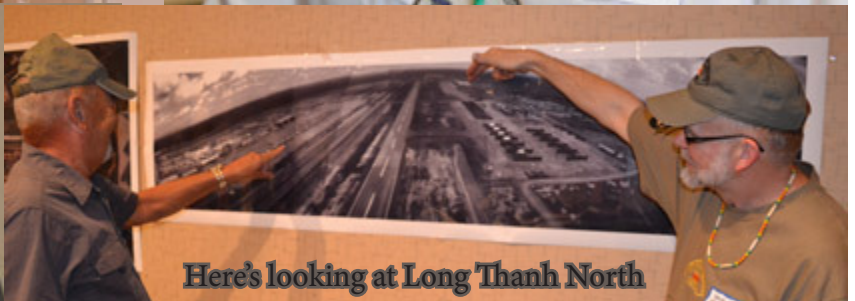
Here's looking at Long Thanh North